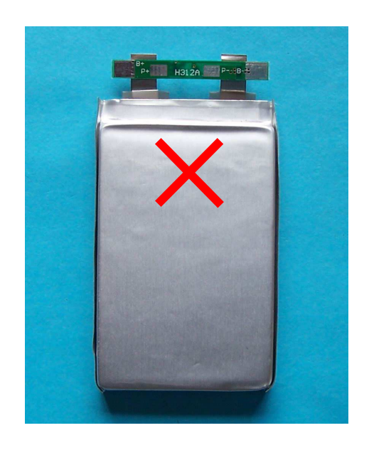
Fig.4. Schematic of wrong assembly