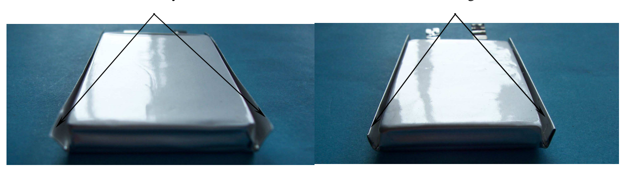
Fig.2. Single folding edge schematic of PL cells