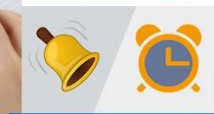
Alarm and Timer