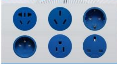
Types of sockets

/ Chinese / English UI freely chosen 16 currency units can be set freely