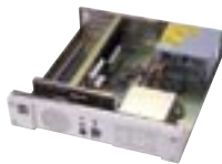
RACK-200W Top View