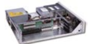
RACK-220AW Top View