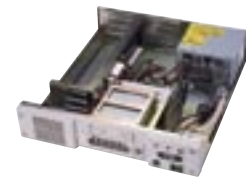
RACK-210W Top View